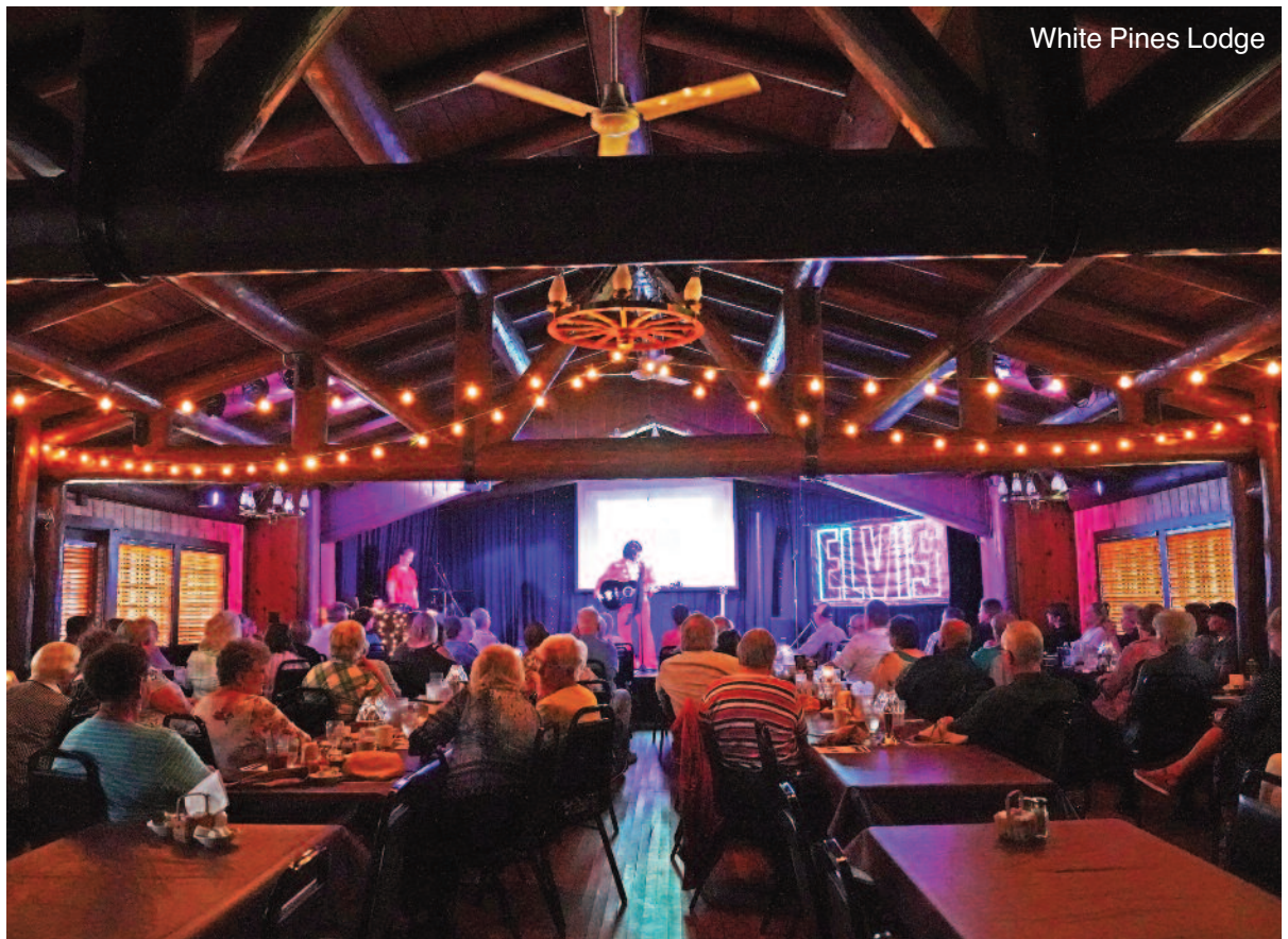
White Pines Lodge

Discover White Pines Lodge, where you will find time to relax and unwind in this peaceful forest. For details phone (815) 655-2400 or go to visitwhitepines.com . □