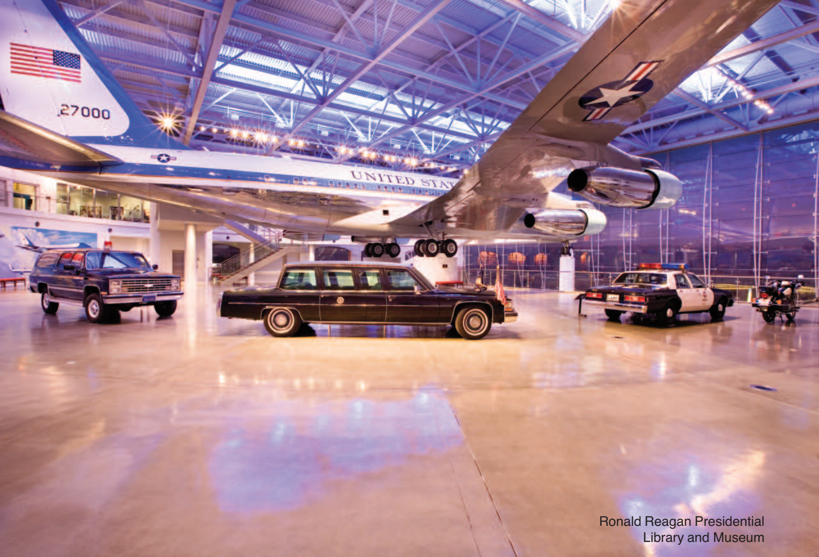
Ronald Reagan Presidential Library and Museum