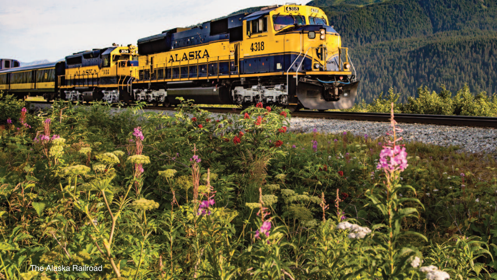
The Alaska Railroad