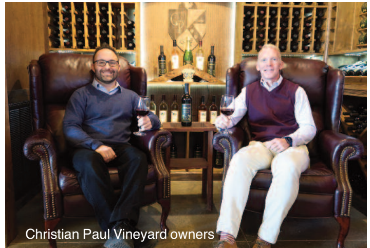
Christian Paul Vineyard owners

His results confirmed a mineral-rich, 18-inch cap of red clay topsoil, and sandy, silty loam below — an ideal structure for growing grapes in the heart of Yadkin Valley wine country. Christian Paul is the Yadkin Valley's 44th winery and 18th along the Surry County Wine Trail.