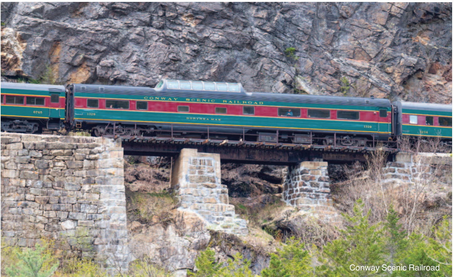
Conway Scenic Railroad

northwestern Pennsylvania with a huge national history impact. Enjoy daily tours, dinner theaters, lectures, music and more.