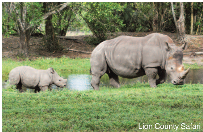
Lion County Safari

For more information view lioncountysafari.com . □