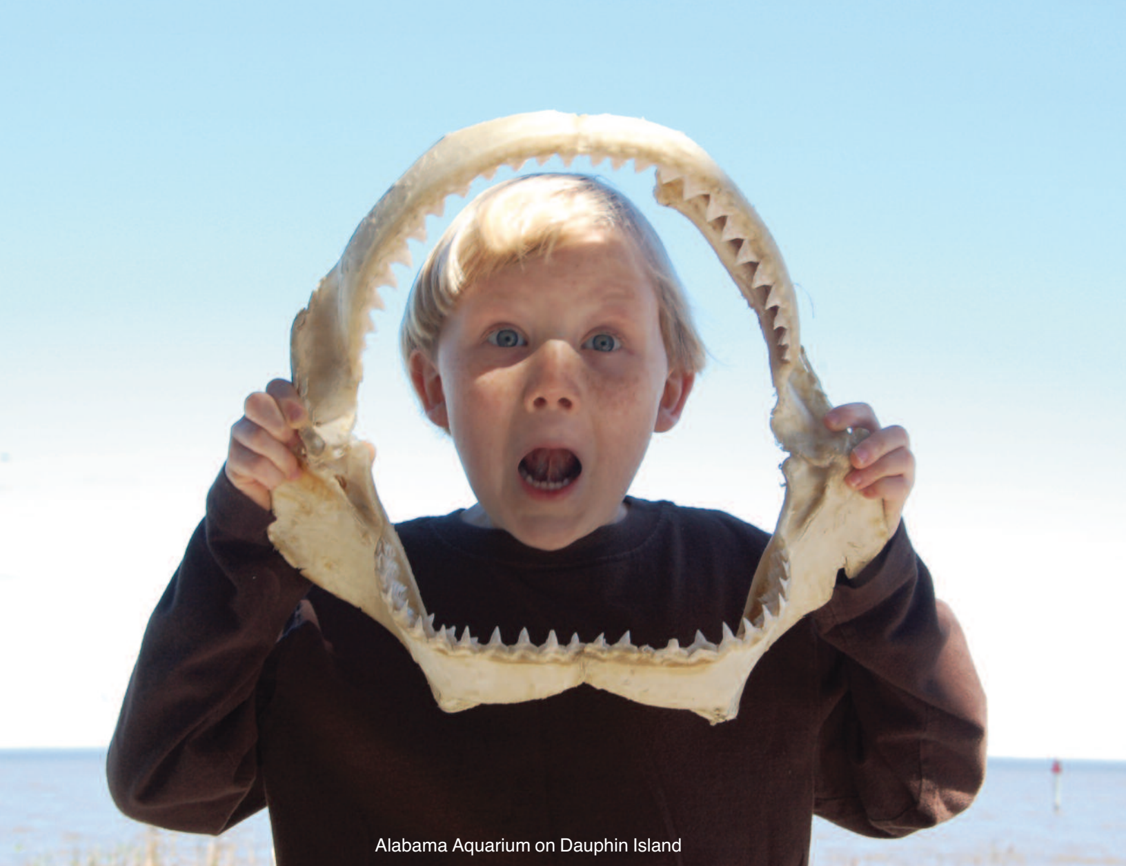
Alabama Aquarium on Dauphin Island