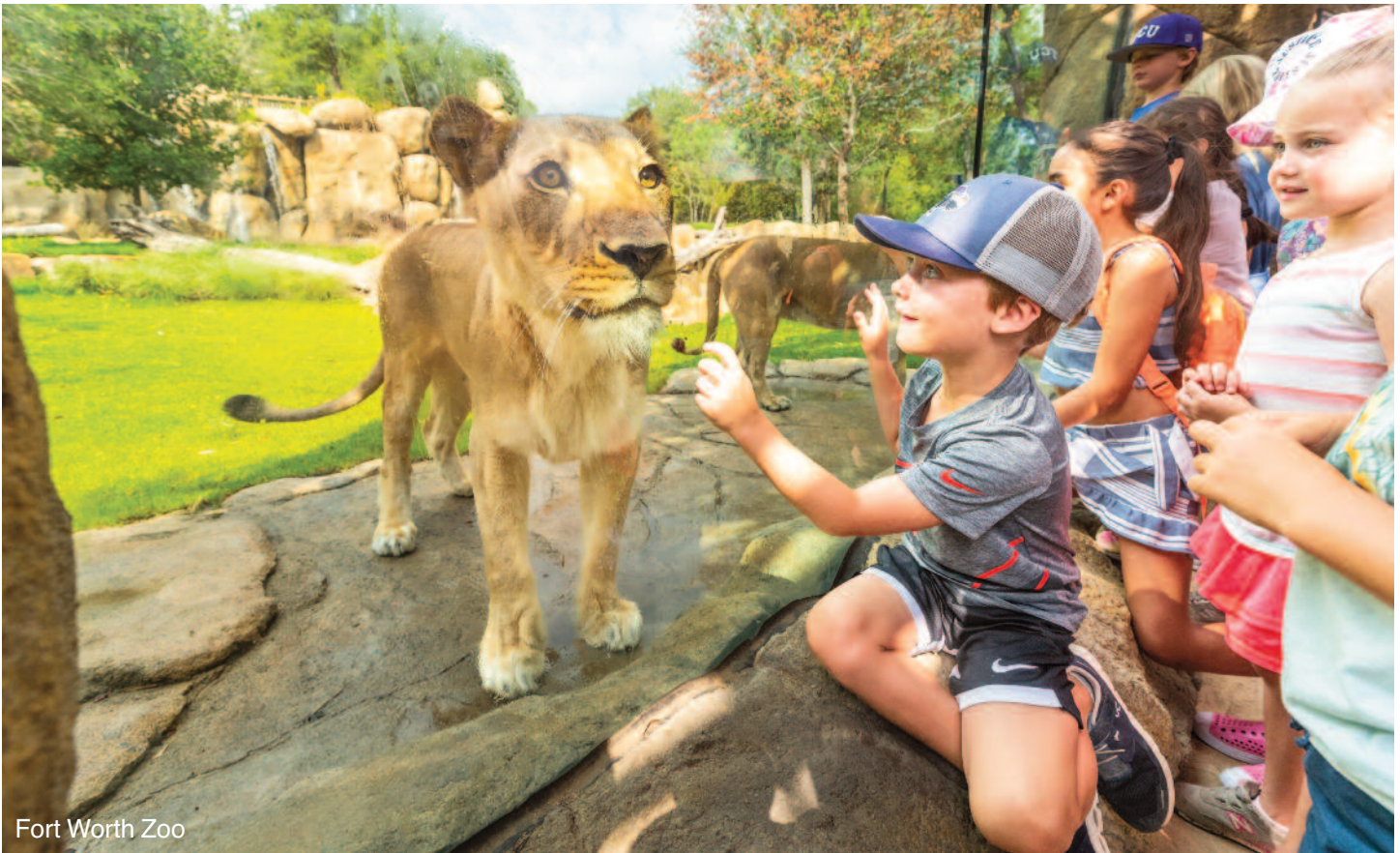
Fort Worth Zoo

and threatened species, as well as strengthening the connection between humans and wildlife.